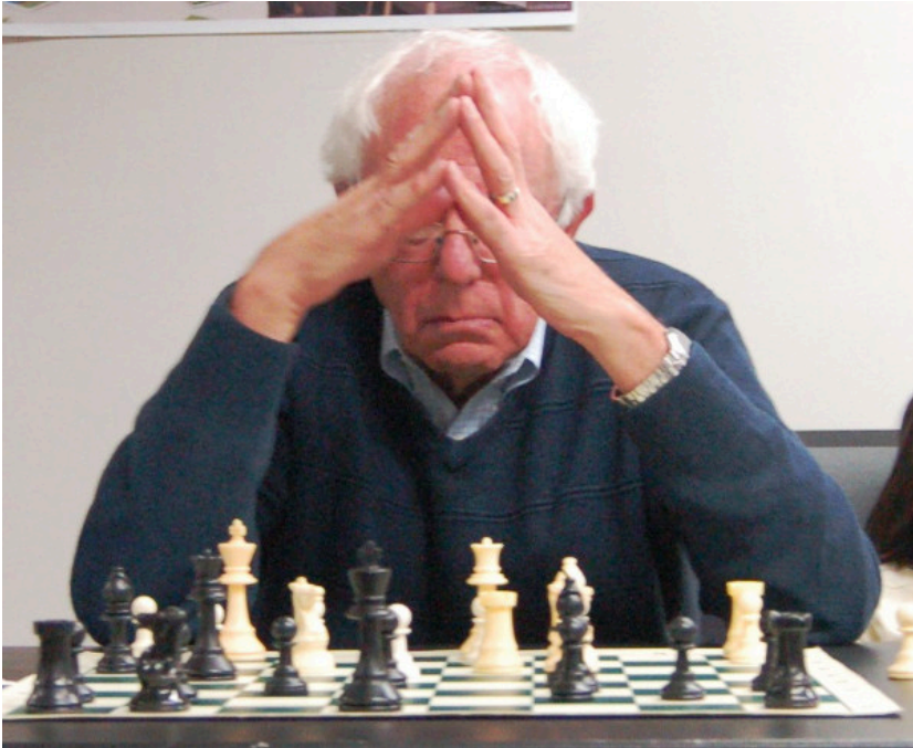
Figure 3. The senator plots his next move.

A younger Sanders may have criticized himself on the same grounds. In his book about becoming a US Representative for Vermont he commented on the Labor Party slogan (“The bosses have two parties. We need one of our own”) with “Hard to argue with that.” 11 And here’s an excerpt from that video he wrote about Eugene Debs: