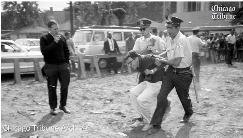
Figure 1. A 21-year-old Bernie Sanders being arrested by the Chicago PD at a civil rights protest in 1963

Disagreement over the realignment strategy contributed to several schisms of the Socialist Party of America in the early 1970s. Harrington resigned and founded the Democratic Socialist Organizing Committee (DSOC) which endorsed the 1972 Democratic candidate George McGovern for president and continued to try to develop a socialist program within the Democratic Party. In 1982 DSOC joined with another democratic socialist group to become the Democratic Socialists of America (DSA) .