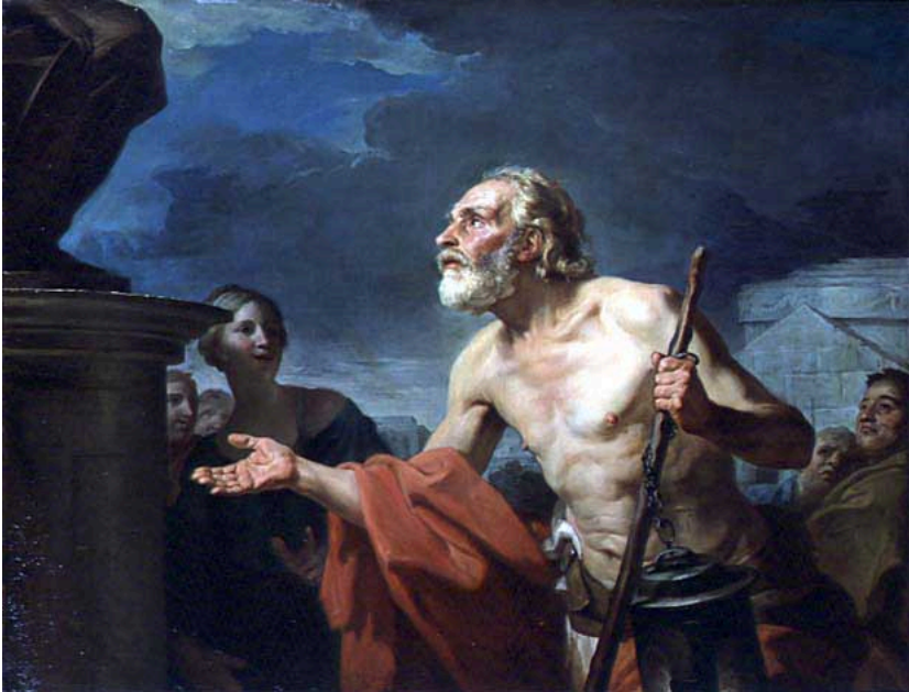
Figure 1. “Diogenes Asking for Alms” by Jean-Bernard Restout (1767). Here Diogenes is begging from a statue, which he did to practice being rejected.